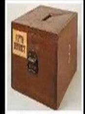
...the ballot box,