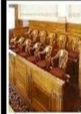
...the jury box,