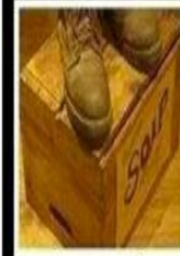
...the soap box,