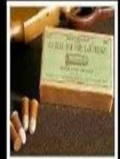
...and the cartridge box.