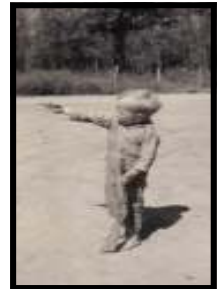
B - Eureka Kid