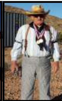
The old boy has a point...