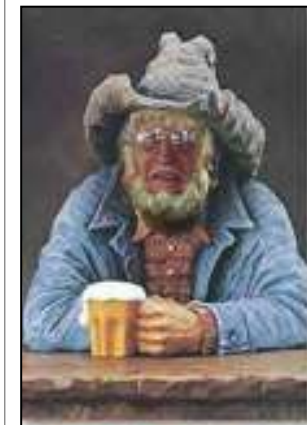
The Old Pipeliner Says...