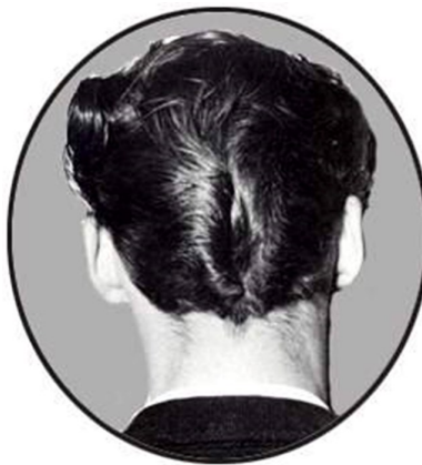
You should have seen JD DA!!!!!!

We are Older than Dirt because we remember D.A. cuts!!